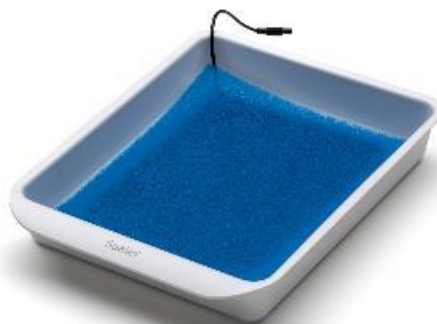
Treatment basin as counter electrode

* Treatment basin means single basin equipped with basin electrode and foam insert)